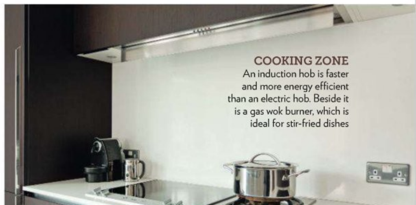
COOKING ZONE An induction hob is faster and more energy efficient than an electric hob. Beside it is a gas wok burner, which is ideal for stir-fried dishes