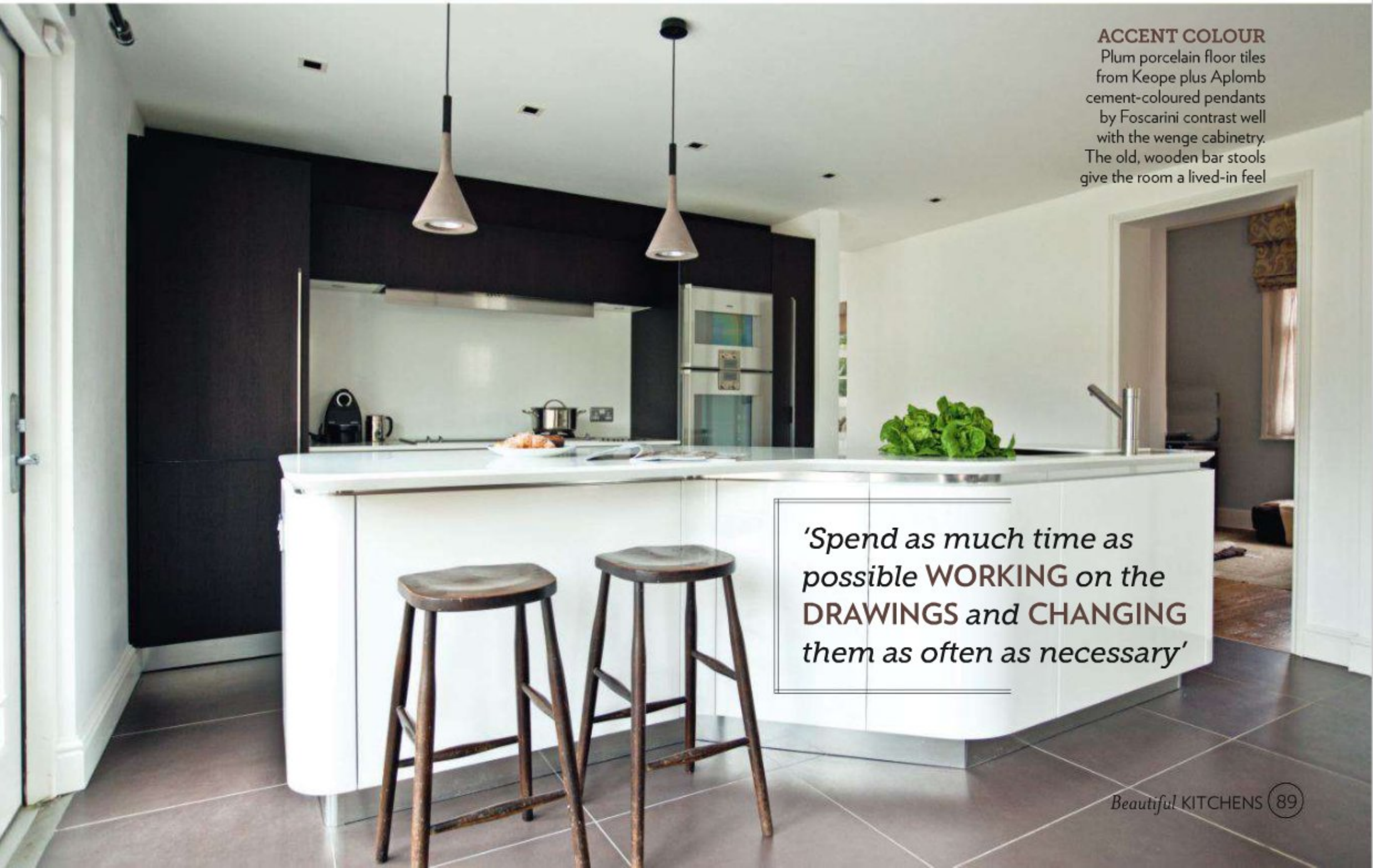
ACCENT COLOUR Plum porcelain floor tiles from Keope plus Aplomb cement-coloured pendants by Foscarini contrast well with the wenge cabinetry. The old, wooden bar stools give the room a lived-in feel

'Spend as much time as possible WORKING on the DRAWINGS and CHANGING them as often as necessary'